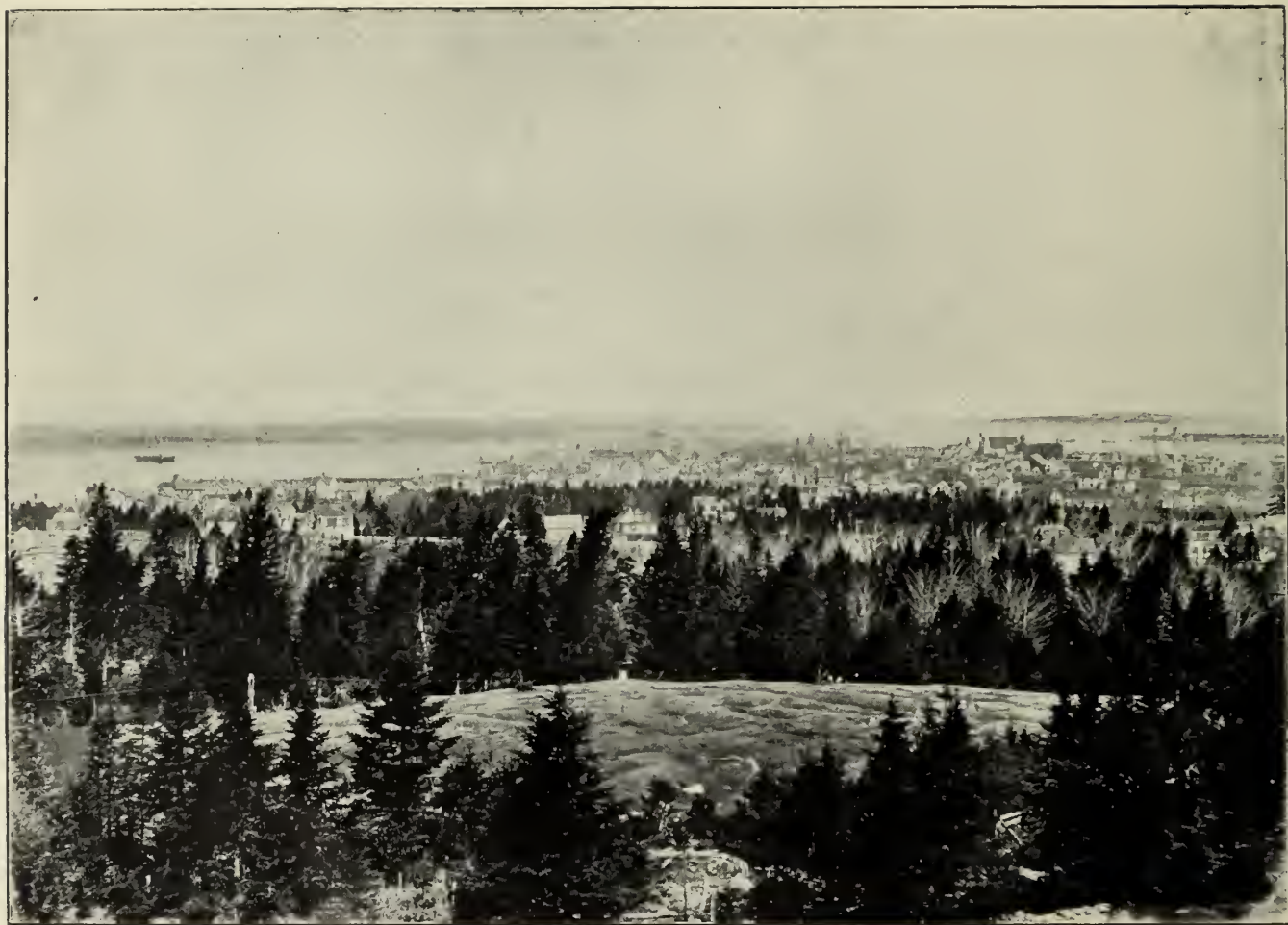
TOWN AND HARBOR OF SYDNEY, CAPE BRETON.